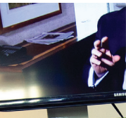
Table Display and Two (2) table personnel passes