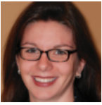
Head of Derivative Strategy Susquehanna Financial Group