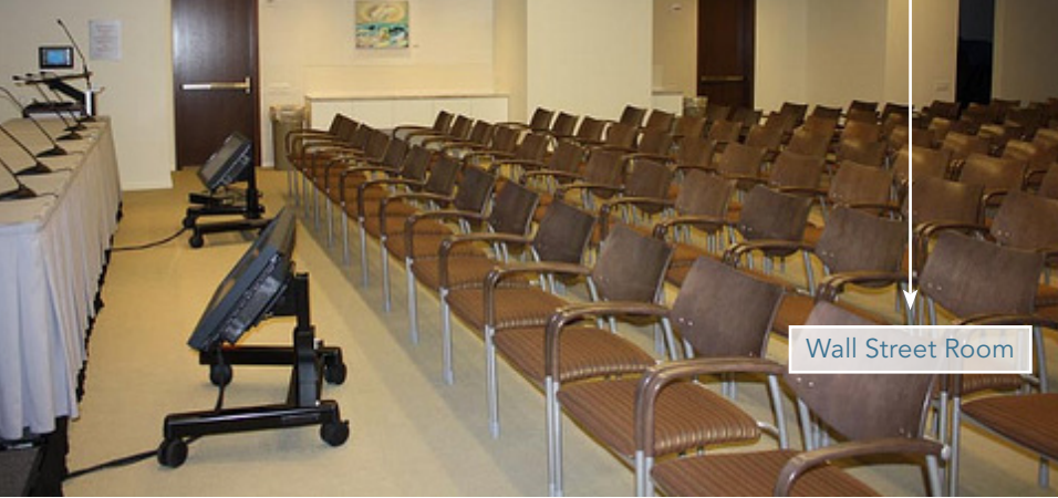
Wall Street Room

The conference rooms are set to your specifications with an in-house set-up team available for consultation. Meeting accompaniments include writing tablets, pens, and high-speed Internet access; catering and equipment rentals are available at an additional fee.