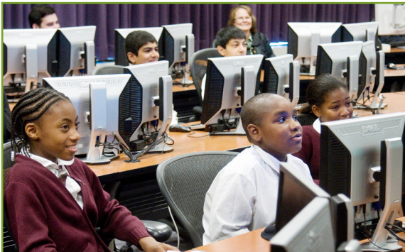
Hands-on training on a simulated trading floor.

The SIFMA Foundation would like to thank our SIFMA member firms, corporate and foundation supporters, individual donors, and volunteers who have helped millions of students become financially prepared for life.