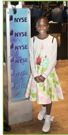
Virtual becomes real at NYSE.

The SIFMA Foundation's sponsors and partners support us in many ways. Some provide financial contributions for the development of new educational programs or to maintain existing programs. Others contribute time and experience by volunteering to visit classrooms using The Stock Market Game™ program, judging the InvestWrite essay contest, speaking at teacher training events, and helping to develop teaching materials. Still others do both!