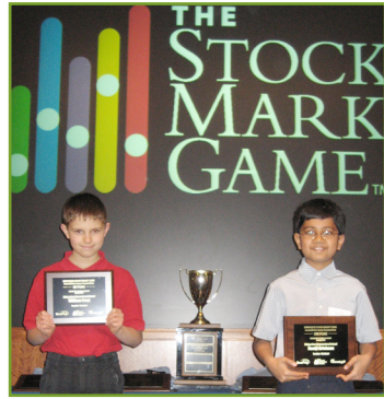
A competitive edge early in life.

The SIFMA Foundation is dedicated to fostering knowledge and understanding of the financial markets for individuals of all backgrounds. Drawing on the support and expertise of SIFMA member firms, the SIFMA Foundation provides financial education programs and tools that strengthen economic opportunity across communities and increase individuals' access to the benefits of the global marketplace.