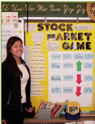
Tracking economic indicators.

by answering a question about long-term saving and investing.