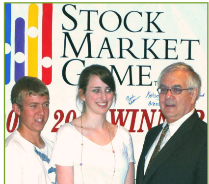
Congressman Barney Frank congratulates student winners.

Parents: Encourage your child's teacher to review The Stock Market Game™ website at www.stockmarketgame.org and register their class to participate.